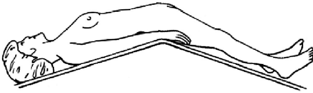
Figure 1. Hyperlordotic position.

patient was transferred to the intensive care unit for further observation.